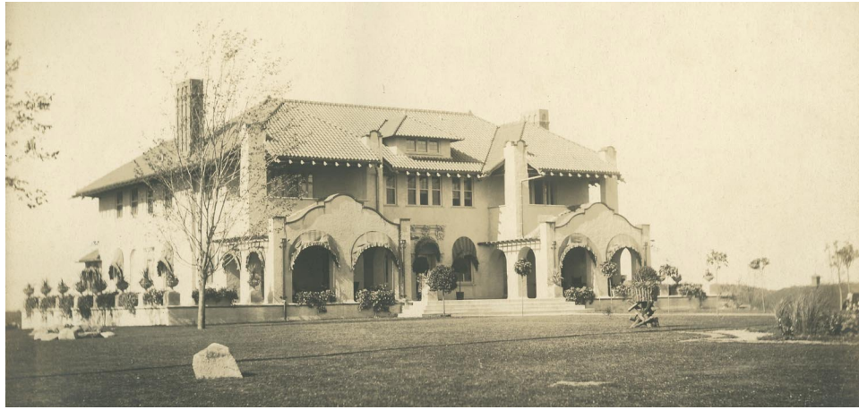
VILLA LINTA, REDDING RIDGE, CONNECTICUT

Photo # NH 102008 USS Linta, photographed in 1917-18